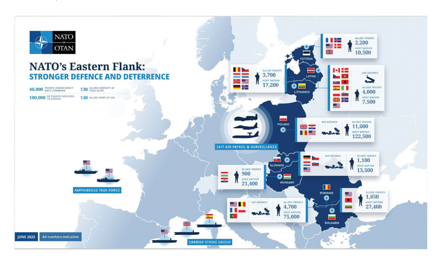
Figure 1: NATO's Forward Defense Posture in the Eastern Flank

However, NATO requires a decisive and comprehensive strategy to effectively address and rectify pressing security challenges and vulnerabilities across the entire eastern frontline, encompassing allied and partner territories. A successful model tested in the Baltic Sea basin could be useful in the Black Sea region, but that would require a significant bolstering of strategic planning and operational capabilities.